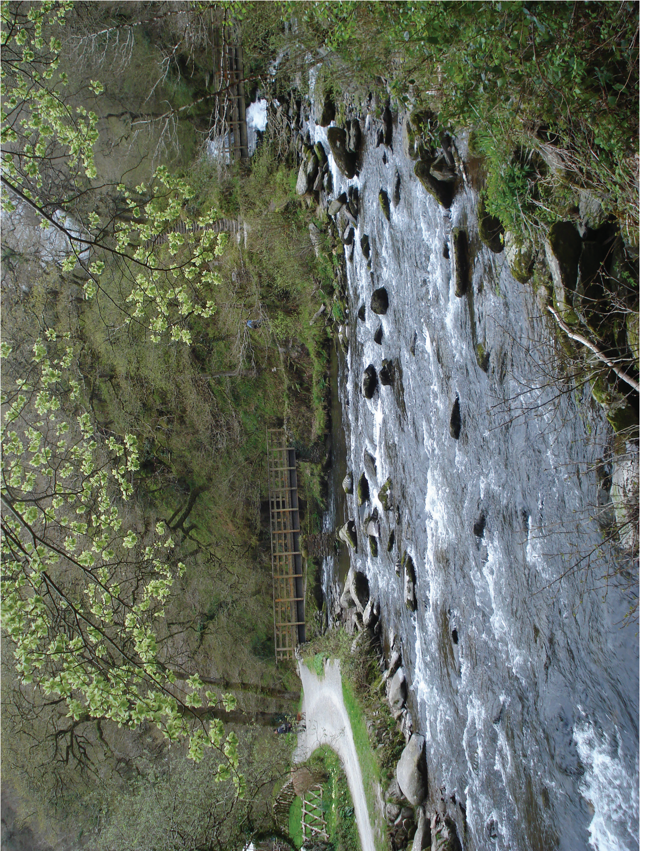
Fig. 3.1 for Question 3