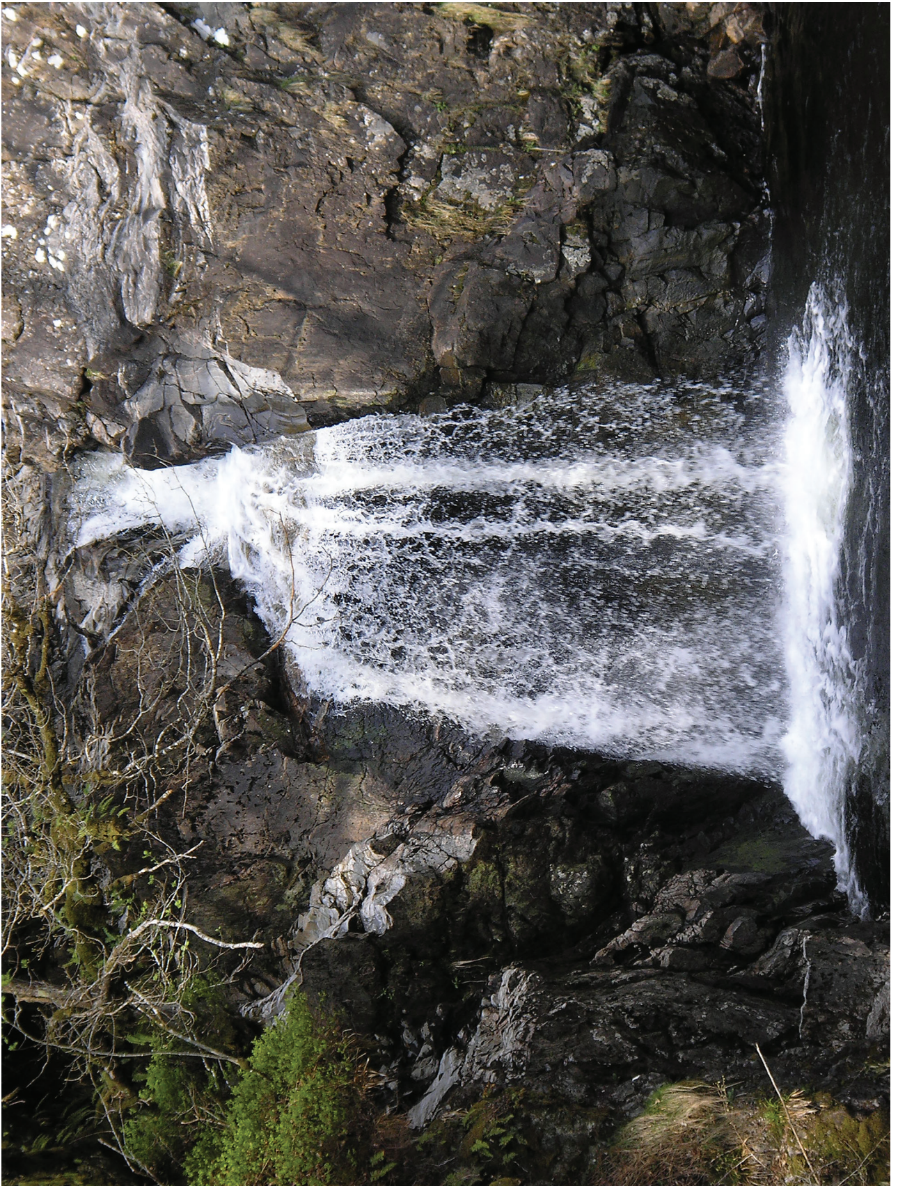
Fig. 3.2 for Question 3