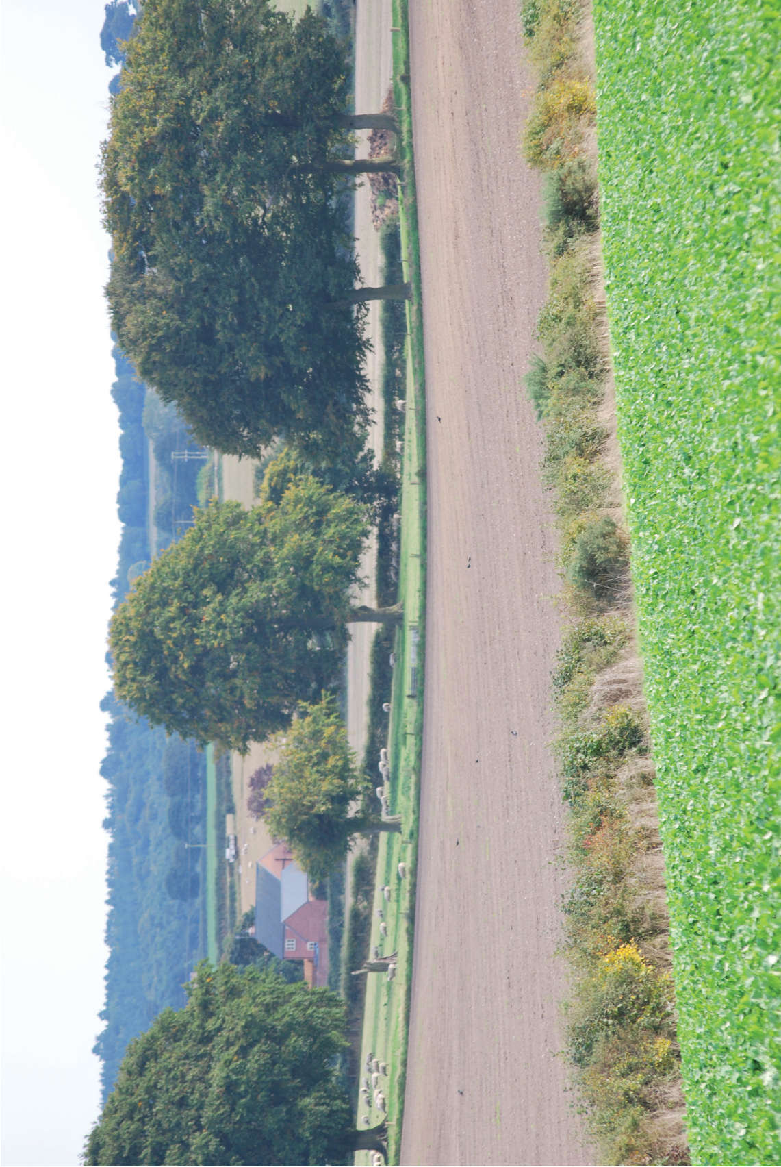
Fig. 5.2 for Question 5